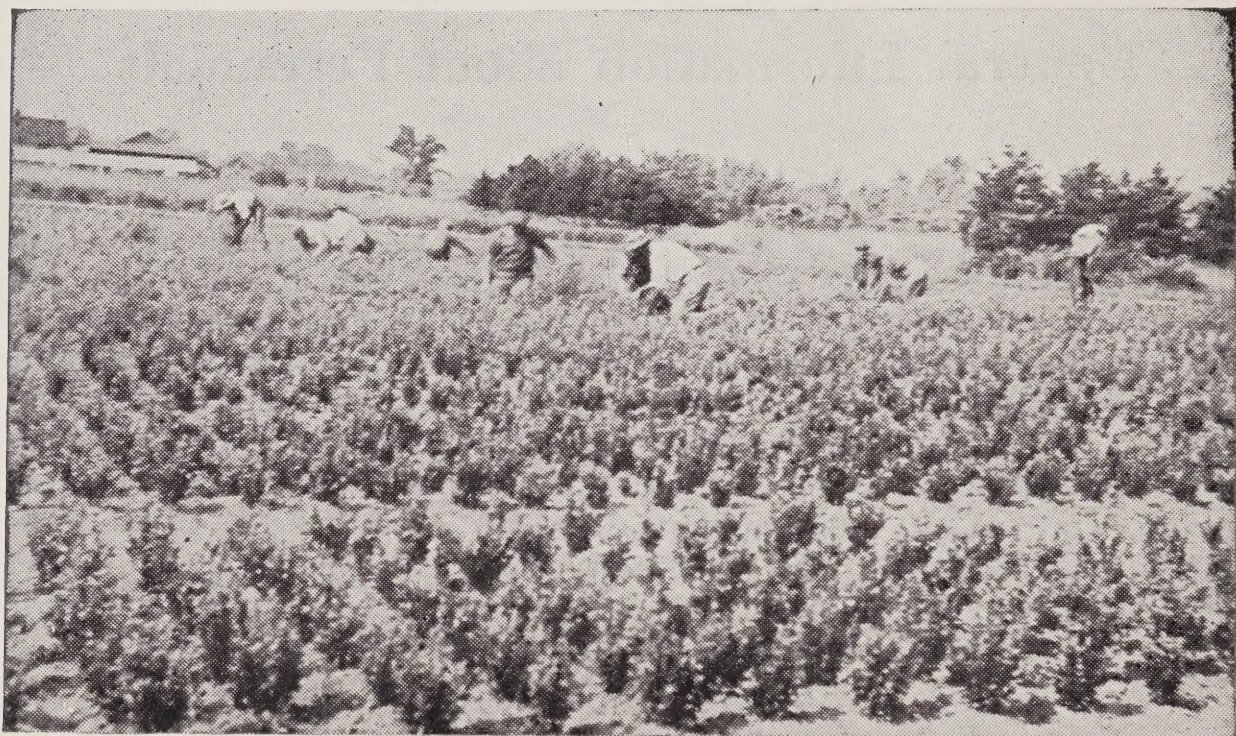
A FIELD OF THREE-YEAR-OLD BUXUS WELLERI